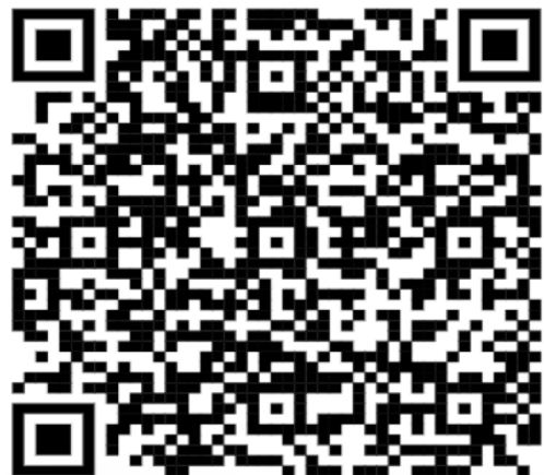
Free E-Books for Reading!