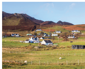
The countryside is used mostly for farming and conservation.