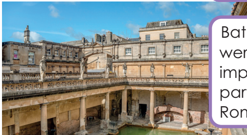
Bathhouse in Bath

The Romans built towns across Britain which followed the same plan with key buildings and roads.