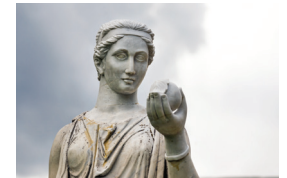
The Roman god Juno

Emperor Theodosius declared Christianity the official religion of the Roman empire.