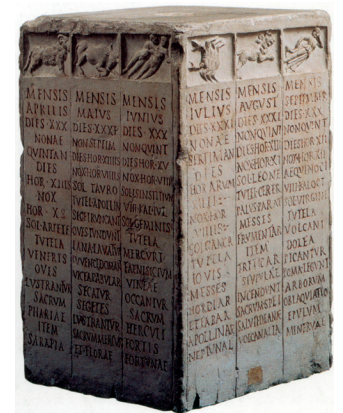
A Roman calendar