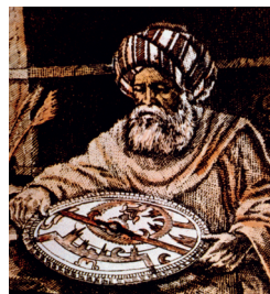
Al-Battani was an astronomer who calculated the length of the year most accurately.