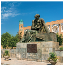
Al-Khwarizmi made advancements in science and maths.